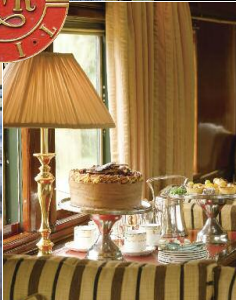
Afternoon tea, Rovos Rail