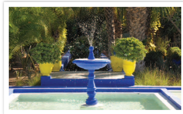
Yves Saint Laurent Majorelle Gardens

Explore Marrakesh on a half day tour visiting the key sights starting with the Yves Saint Laurent garden which was originally created by the French artist, Jacques Majorelle. After his death, the garden was repurchased by Pierre Berge and Yves Saint Laurent who restored it to its former glory. The originality of the garden comes from the combination of the luxurious vegetation