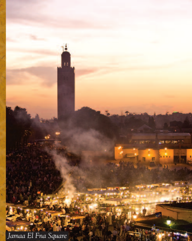
Jamaa El Fna Square

and architectural features with more traditional Moroccan elements which is said to offer a place for inspiration and contemplation. The Yves Saint Laurent gardens feature strong use of bold cobalt blue which is used extensively in the garden. Stroll through the labyrinth of alleyways in the old medina, the historic part of the city, and see the fourteenth century Ben Youssef Medrassa, a former Koranic school noted for its latticework interior and the 12th-century Kubba El Baroudiyne with its Almoravid-style Dome. We end our tour in the Jamaa El Fna Square which is close to your hotel. Free afternoon and evening so relax at your hotel or head out and enjoy the city by night.