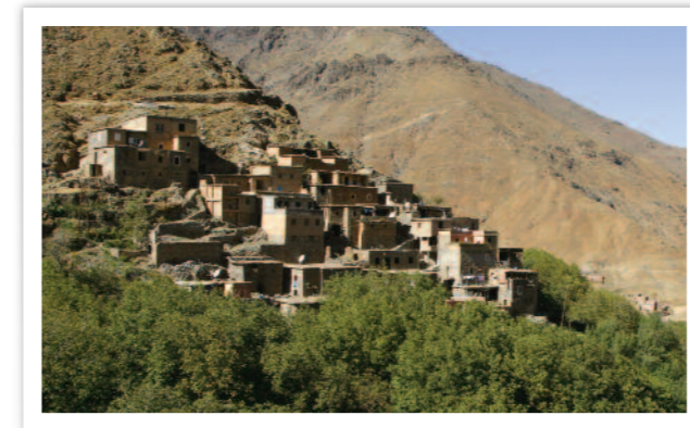
Imlil village, Atlas Mountains

After breakfast, travel by private vehicle to the Atlas Mountains and the Toubkal National Park, set within the High Atlas Mountains, which contains eight distinct mountains. You'll enjoy the spectacular scenery of vegetation, mountain streams, coloured rock cliffs, quaint Berber villages and smiling local mountain people and an ancestral lifestyle which remains today. Nature rules supreme in these regions, dictating the existence of these tribal men and women. Your first visit is to the village of Tahanaout with its traditional rural market, full of colour and bustling with activity, and with plenty of photo opportunities. We then continue on to the second village of Imlil, which is base camp for trekkers and mountaineers and a fascinating place