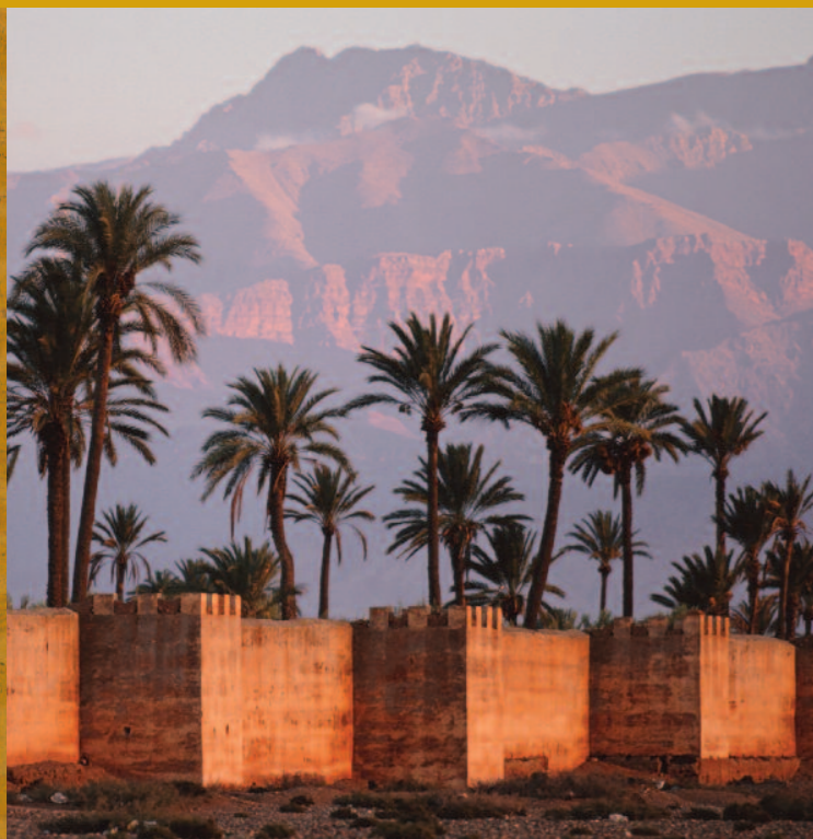
Marrakesh walls and Atlas Mountains