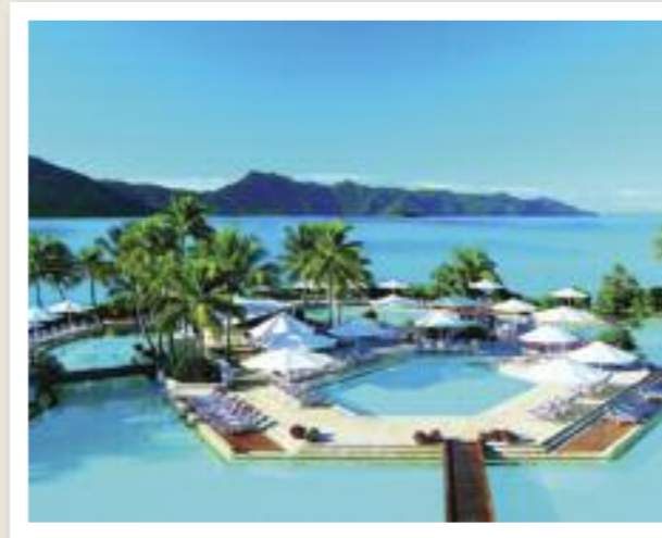
Hayman Island Resort, Great Barrier Reef

4-nights from £975 per person based on twin/double share, Retreat Wing accommodation with daily breakfast, return scheduled flights to Hamilton Island, return launch to Hayman Island and 1 night at Four Seasons Sydney. Single supplement: £645.