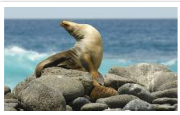
Sea lion, Kangaroo Island

Meals: Breakfast Hotel: Sails in the Desert