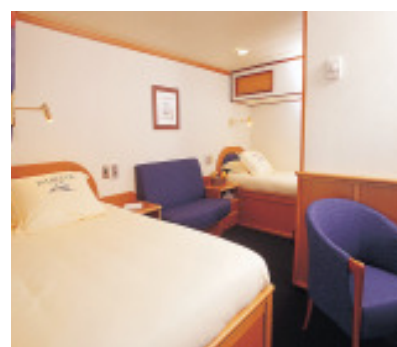
Cabin, Isabela II