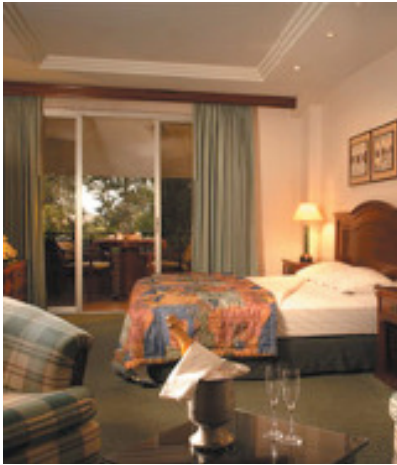
Hotel Oro Verde, Cuenca