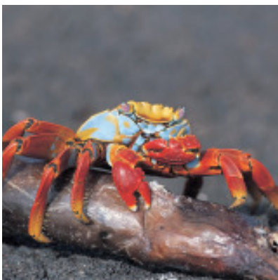
Sally Lightfoot Crabs