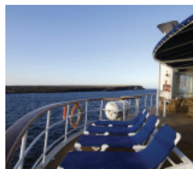
Sundeck, Isabela II