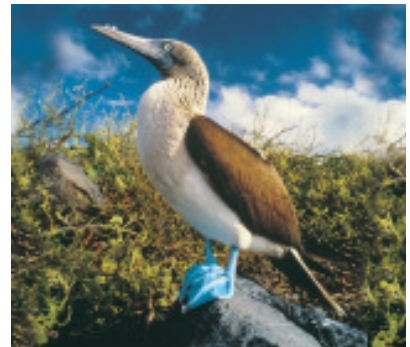
Blue Footed Booby

The only penguins found north of the equator, they are approximately 14 inches in height and are more duck-like than their southern cousins of the Antarctic. The penguins were brought to the Galápagos by the Humboldt Current, which brings cold waters and nutrients north from Antarctica. Swimming occupies much of the day as they reach speeds of up to 24mph !