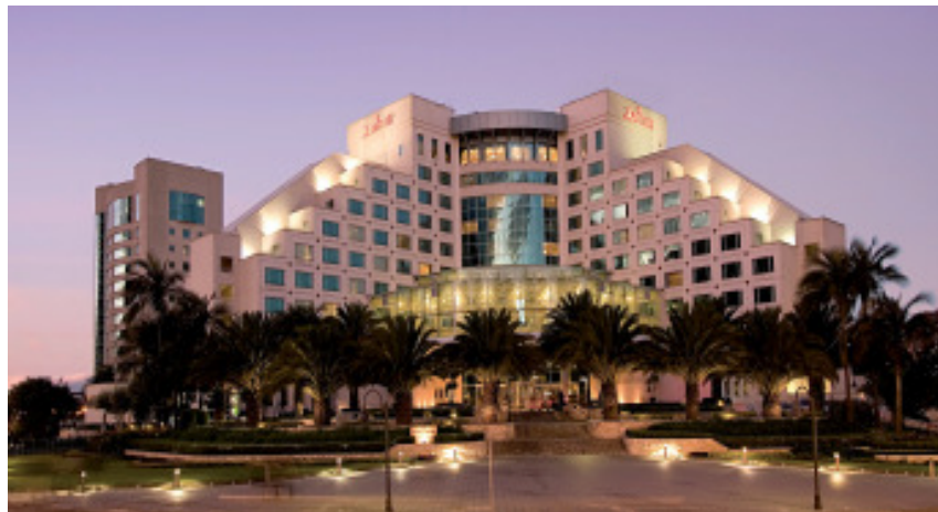
JW Marriott, Quito