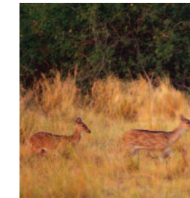
Far left: Buddha, Dambulla Rock Cave Temples Left: Sambhur spotted deer Below: Nuwara tea plantations

Meals: Breakfast, Lunch, Dinner. Hotel: Mahoora Luxury Tented Safari Camp.