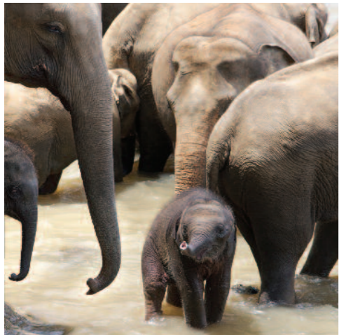
Pinnawela Elephant Orphanage, Kandy

Meals: Breakfast, Dinner. Hotel: Cinnamon Lodge.