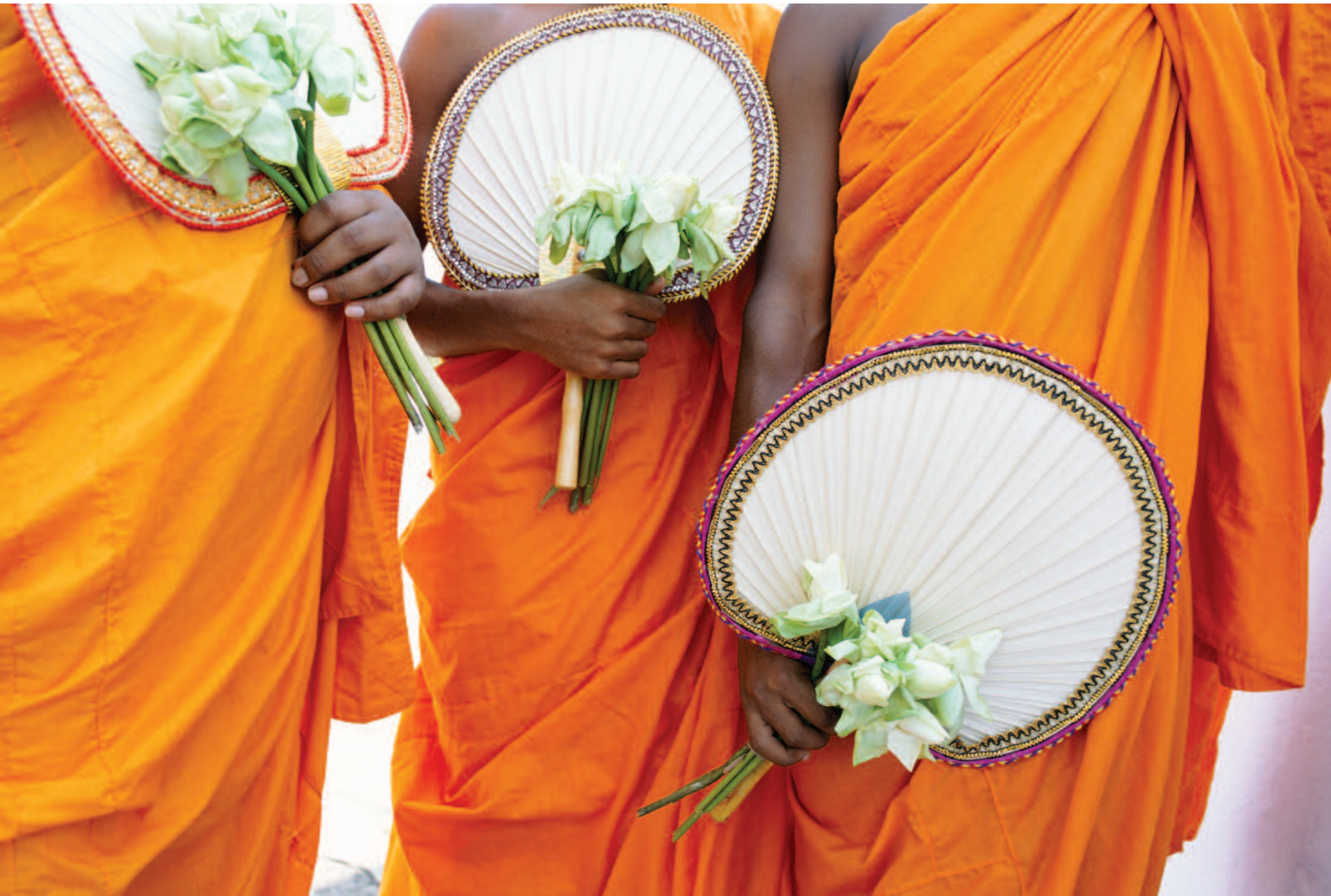
Monks with lotus flowers

From raw, untamed nature in the heartlands, to rich cultural experiences in the mountains, to spiritualistic encounters in serene temples; every day in Sri Lanka is different from the last.