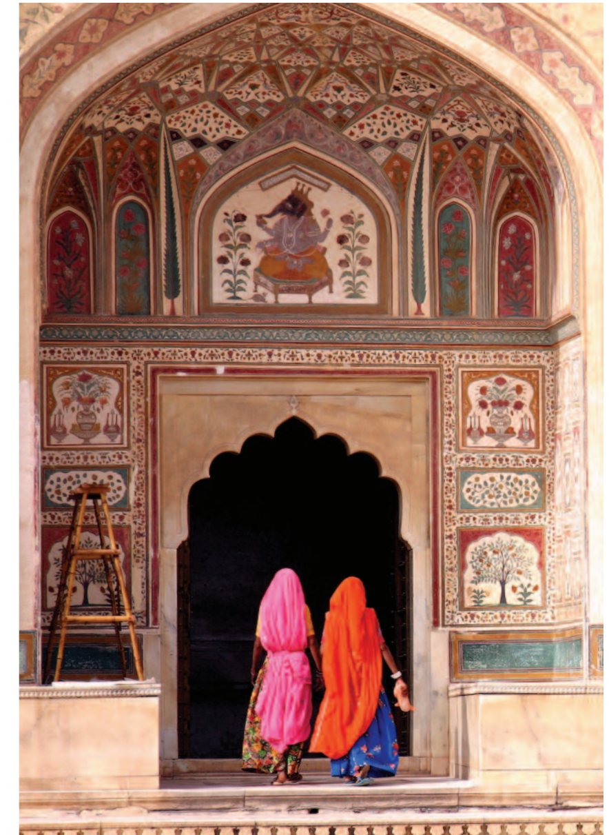
Below: Amber Fort, Jaipur