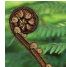
Left: Native fern Far left: Moeraki Boulders, Dunedin Below: Hawke's Bay, Napier